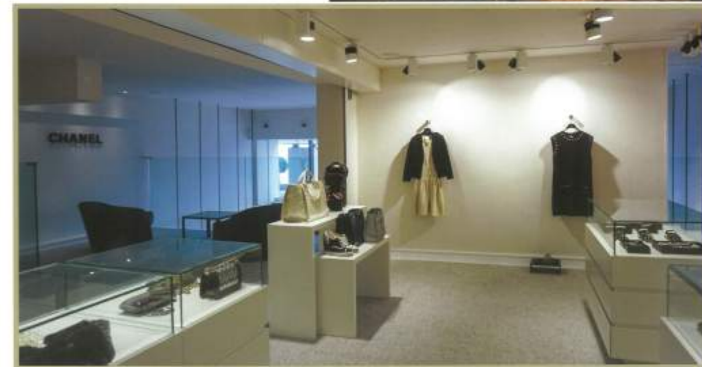
The brand new Chanel Corner at Tiffany Limassol