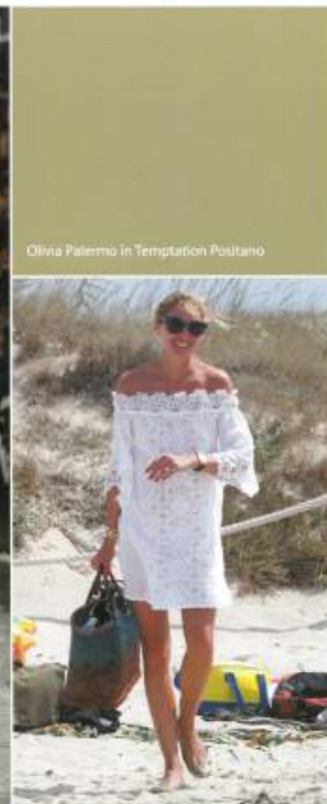
Olivia Palermo in Temptation Positano