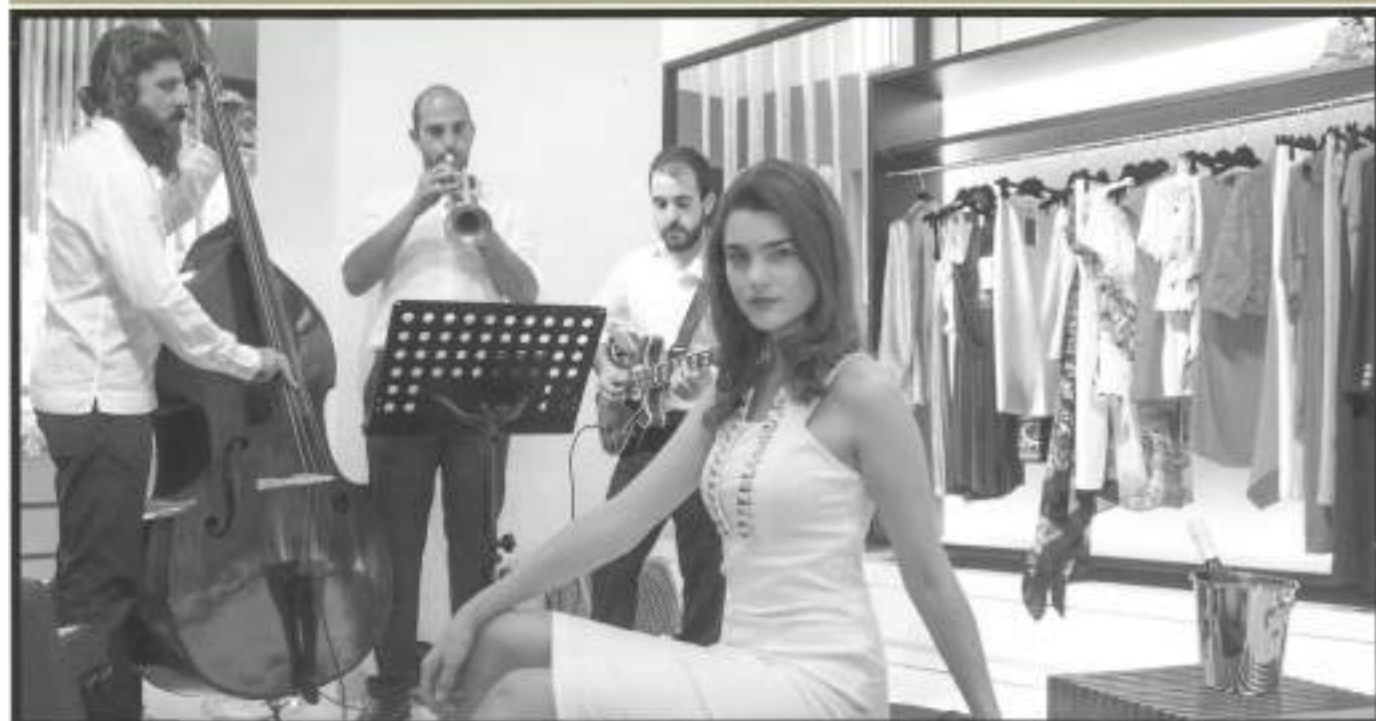
Live jazz band, models and a festive atmosphere at the Tiffany Limassol Open Day Event, Summer 2015