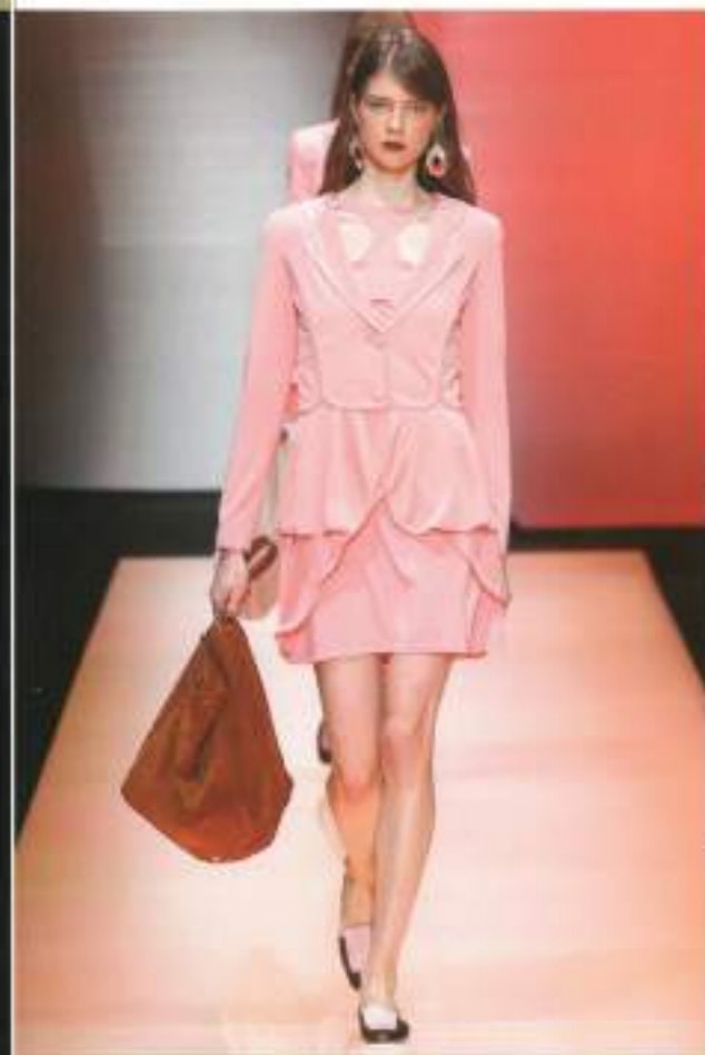
Emporio Armani ready-to-wear SS16 collection Now in store at Tiffany Nicosia